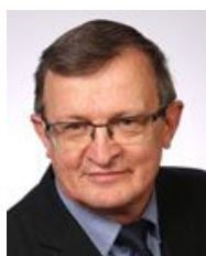
Mr Tadeusz CYMAŃSKI Committee on EU Affairs LAW AND JUSTICE - ECR