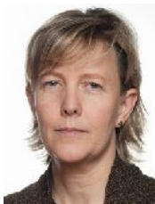
Ms Maria Luís ALBUQUERQUE

Vice-Chair, Committee on European Affairs PS - S&D