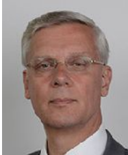
Mr Marnix VAN RIJ Vice-Chair, Committee on Finance CDA - EPP