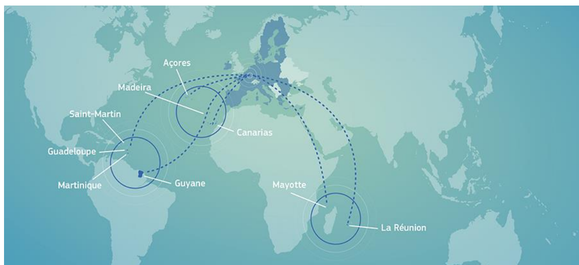
Figure 1: Geographical distribution of EU outermost regions

The special situation of these regions is recognised under Article 349 of the Treaty on the Functioning of the EU (TFEU). This article allows for specific measures for these regions to be taken as it acknowledges that the permanent and combined constraints affect their economic and social situation and severely restrain their development. It permits such measures provided that they do not undermine the integrity and the coherence of the Union legal order, including the internal market and common policies. Such measures concern various policies, including taxation, support to create jobs, boosting competitiveness, and preserving the environment.