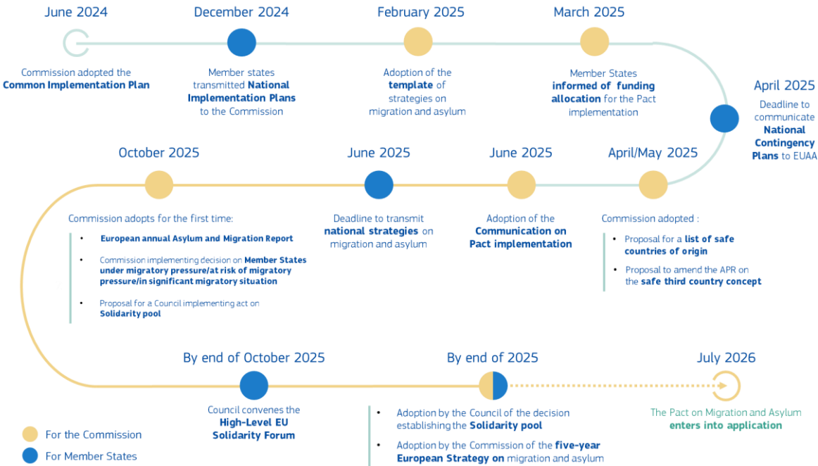
Figure 1: Timeline of the transition period

With this Communication, the Commission informs the European Parliament and the Council on the implementation of the Pact, in accordance with Article 84 of the Asylum and Migration Management Regulation (5) . Building on the key actions of the Common Implementation Plan of June 2024 and in anticipation of the launch of the first annual solidarity cycle in October 2025, this Communication presents a state of play of the progress made at EU and national level on the implementation of the Pact and provides an overview of the state of implementation in relation to each of the ten building blocks. As a next step, the Annual Report on Migration and Asylum of October 2025 will include an updated state of play of the implementation of the Pact. The Commission will then present a long-term European Asylum and Migration Management Strategy by the end of this year to support an integrated and coordinated approach to the implementation of the Pact, both at EU and national level.