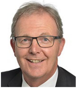
Mr Axel VOSS (DE)