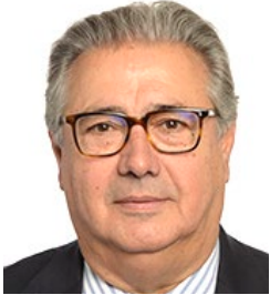
Mr Juan Ignacio ZOIDO (ES)