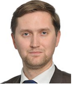
Mr Jaak MADISON (ET)