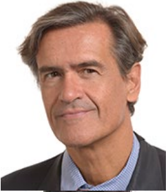
Mr Juan Fernando LÓPEZ AGUILAR (ES)