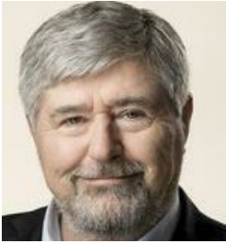
Mr Søren SØNDERGAARD Member Committee on European Affairs The Red-Green Alliance - GUE/NGL